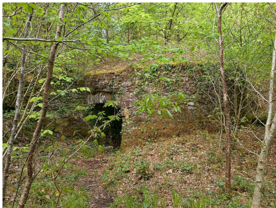
The Lime Kiln at Little Milford. One of the Freystrop Community's listed buildings

Freystrop Community Council (FCC) comprises of six Councillors – the maximum number allowed based on the population within the Community. There were no changes to the structure of the Council during this financial year.