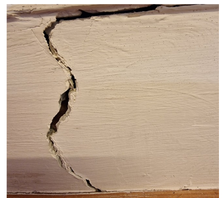
An example of the subsidence

During a project to carry out internal improvement works to the Hall major subsidence has been observed in the Hall's structure. Insurers have refused to cover the cost of the substantial repairs required citing evidence of problems existing for over 15 years. Advice from builders was that a significant cost would be involved to make the structure safe before carrying out changes to the interior. The works planned for 2023 have been abandoned. FCC is determined that Freystrop will not lose a hall as a valued community asset and is working hard to provide the best solution.