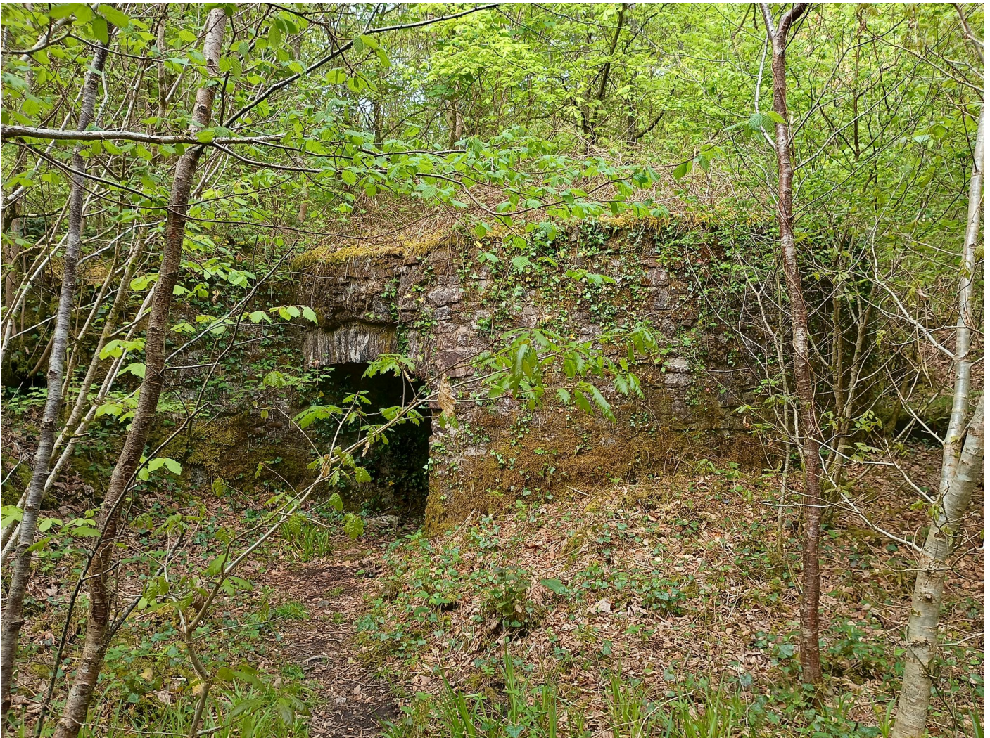
The lime kiln at Little Milford One of the five listed buildings in the Freystrop Community

This winter edition of the Freystrop Community Newsletter will be the last at this time of year.