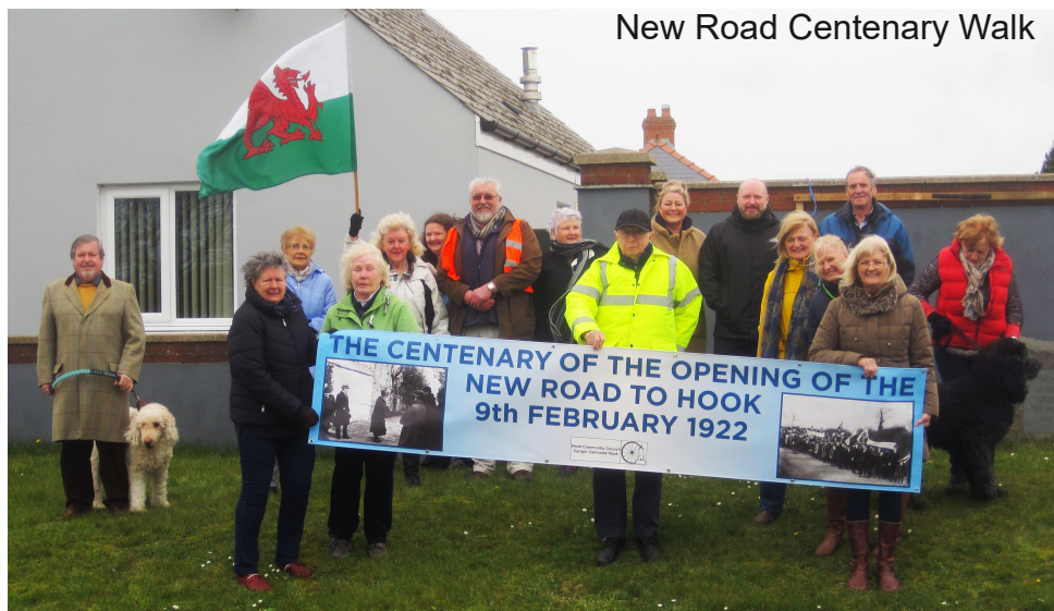
New Road Centenary Walk

POST PANDEMIC - ACTIVITIES RESUME ONCE AGAIN