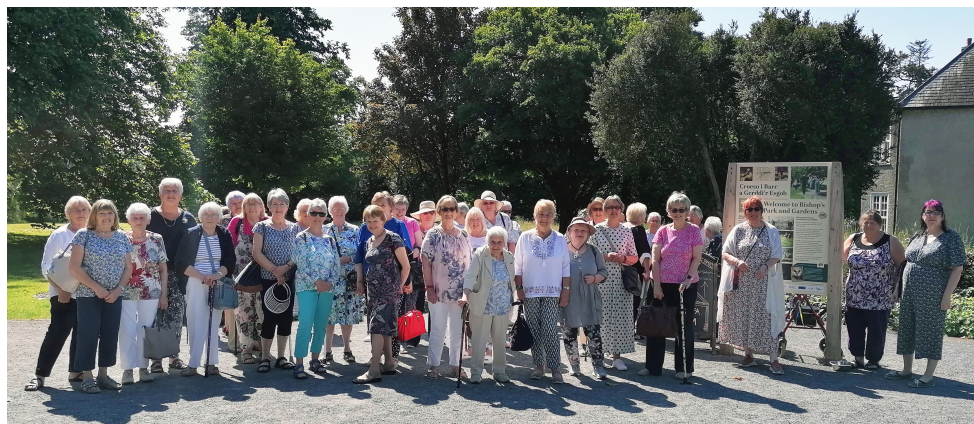
WI Visit to Carmarthen Museum

POST PANDEMIC - ACTIVITIES RESUME ONCE AGAIN